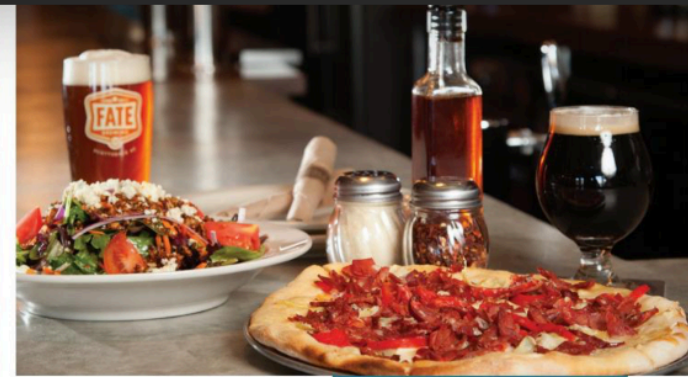
(Special to Airpark News)

Growler U.S.A. (beer): With more than 100 beers on tap, Growler U.S.A. is bound to have a brew for