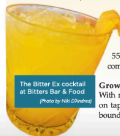
The Bitter Ex cocktail at Bitters Bar & Food

Bitters Bar & Food (cocktails): The 17 craft cocktails on this menu each have the word "Bitter" in the title, but every one is oh-so-sweet. Recommended: The Bitter Ex (habanero vodka, falemum, lime and mango); Bitter, Old and Fashionable (bourbon, hazelnut, orange and chocolate bitters). 1455 N. Scottsdale Road, Scottsdale, 480-550-5088, bittersbar.com .