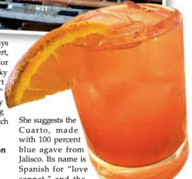
Tequila-infused cocktails: Mission accomplished at The Mission Kierland.