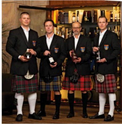
Scotch ambassadors school visitors in the ways of whisky at Westin Kierland.

"What makes our collection unique is our