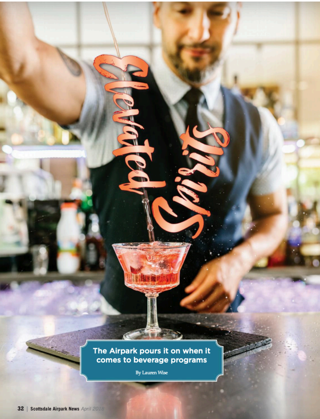
The Airpark pours it on when it comes to beverage programs By Lauren Wise