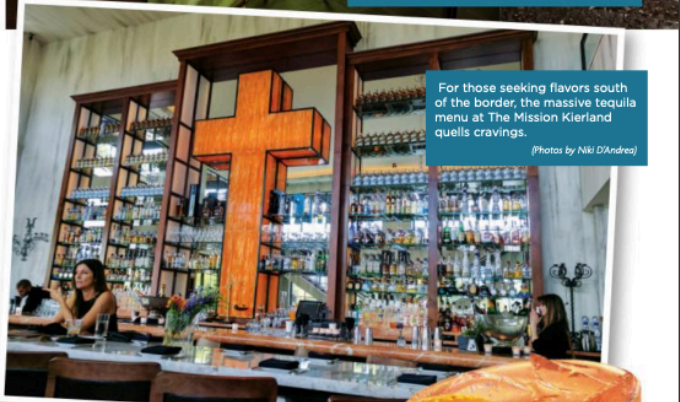
For those seeking flavors south of the border, the massive tequila menu at The Mission Kierland quells cravings.

She suggests the Cuarto, made with 100 percent blue agave from Jalisco. Its name is Spanish for "love sonnet," and the bottle comes with a guitar pick.