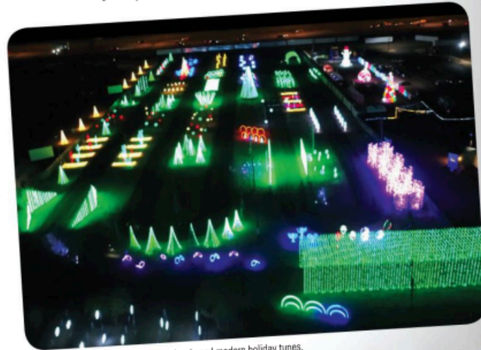
Illumination's lights are timed to classic and modern holiday tunes.

They continued to push the limits, with the original Illumination sprawled across 14 acres. New additions include a 100-foot-wide nativity scene and an expanded Holiday Boulevard. In 2018, the boulevard offers free parking and free admission separate from the Illumination drive-thru. Patrons can indulge in treats such as candy apples, hot cocoa and brick-oven pizza; dance through gigantic ornaments; visit the Elfie selfie stations or the post office to write a letter to our troops; bounce through Christmas-themed inflatables; and try their hands at ornament